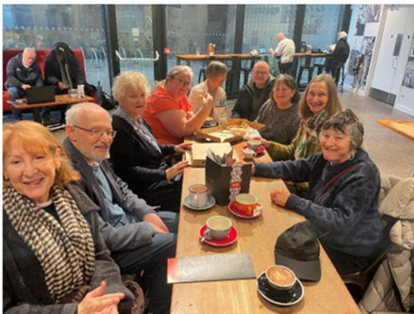
Members of Cinema group taking refreshments at HOME cinema.