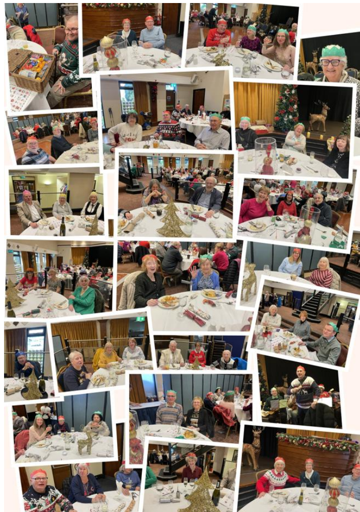
SMu3a Christmas Lunch 2025

March 2026 Newsletter items to: editor.smu3anews@gmail.com